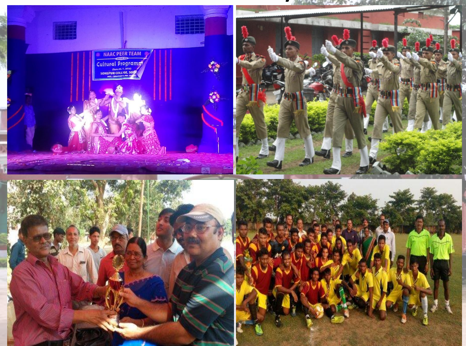
e-Newsletter of Sonepur College, Sonepur